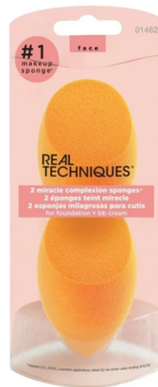
Beauty Blender for foundation and concealer my fav is from Walmart "Real techniques"